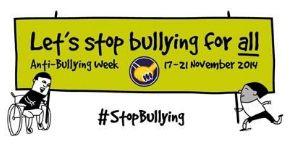
Photo Pledge – Show your support by taking a photo or video of you and your friends or family holding up a sign saying 'lets stop bullying for all.' Share it with us online using the hashtag #StopBullying.

This Anti-Bullying Week we want you to have fun with your friends and celebrate diversity and difference. Check out some ideas below of some cool activities you could do during Anti-Bullying Week. However big or small, your actions will make a big difference.